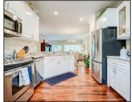
St. Augustine Kitchen View (Example)