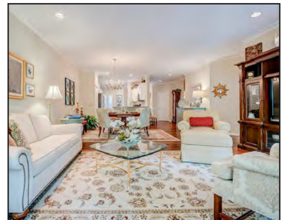
St. Augustine Family Room (Example)